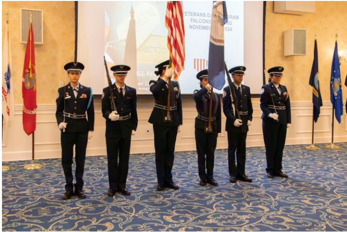
Chantilly AFJROTC Color Guard