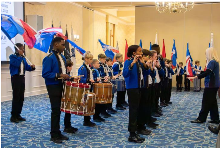
Linton Hall Fife and Drum Corps